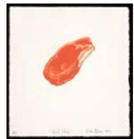
Kara Maria, Veal Chop , 2003. Etching on paper; 12 1/2 x 11 inches; Courtesy of the artist.