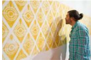
Sita Kuratomi Bhaumik, To Curry Favor , 2011. Curry Powder from Oasis Food Market, Oakland, CA, and adhesive on wall; Site-specific installation; 20 x 3 feet; Courtesy of the artist.