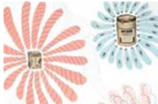
Kirsten Stolle, Miracle Grow swatch, 2012. 30 x 22 inches; Gouache, graphite, collage on paper; Courtesy of the artist.