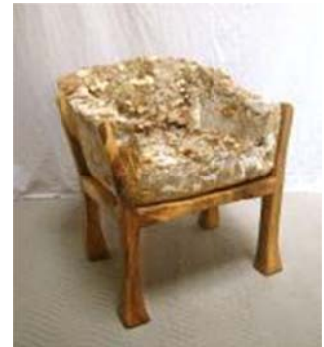
Phil Ross, Yamanaka Wisdom ; Selection from The Workshop Residence in SF.