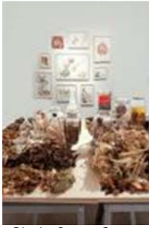
Emilie Clark, Sweet Corruptions , 2010 – 2012. Latex-preserved food detritus on 8 x 8 feet table, three drawings (30 x 42 inches), one painting (72 x 60 inches). Courtesy the artist.