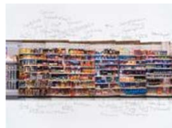
Rosemary Williams, Supermarket , 2008. Seven printed and annotated panels; 72 x 308 inches. Courtesy of the artist.