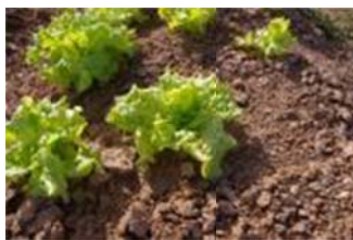
Matt Moore, Still from Lifecycles , 2010. Mixed media; dimensions variable; Courtesy the artist